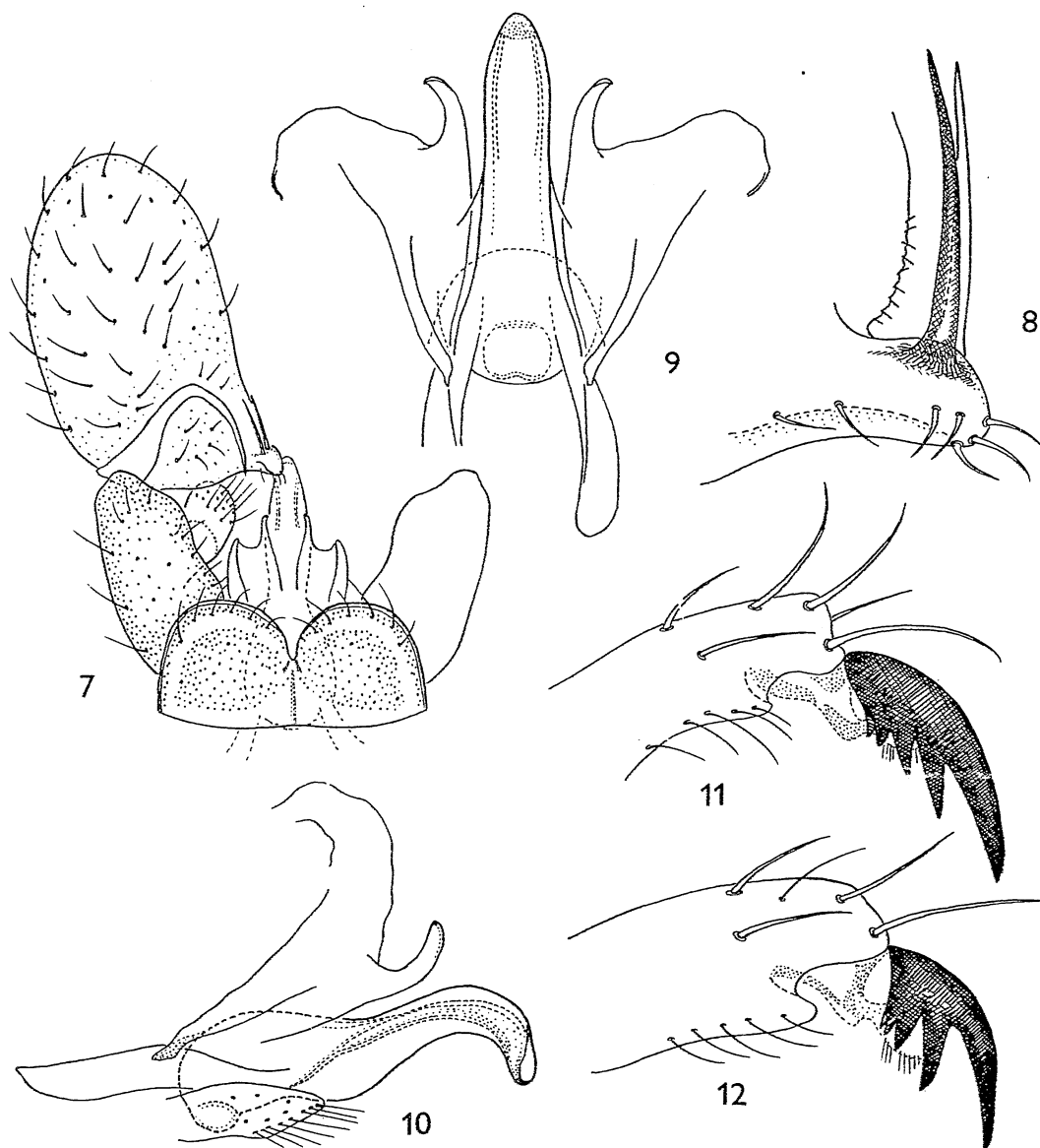
Figs. 7-12. Dicranomyia (s. str.) kamakensis sp. n. (paratype, 3.v.1980): 7: Male genitalia, general view, dorsal; 8: Rostrum of ventral dististyle, laterodorsal/anterior; 9: Aedeagal complex, dorsal; 10: Aedeagal complex, lateral; 11: Male hind tarsal claw. Dicranomyia (s. str.) mitis (Czechoslovakia): 12: Male hind tarsal claw.