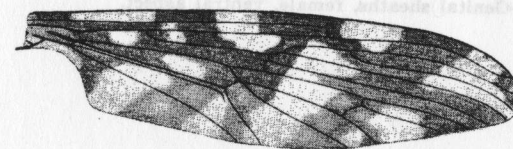
Text-fig. 1.—Wing of Radinoderus dorrigensis , n. sp.; holotype ♀.

Anterior mesonotum light-brown, the disk almost covered by black stripes, the median stripe especially wide; scutellum obscure yellow, margined with dark-brown and including a median line of the same colour; postnotum dark. Pleura dark-brown; variegated with obscure brownish-yellow on the sternopleurite and cephalic portion of the pteropleurite. Halteres dusky at base, the outer half of the stem light-yellow, the knobs dark-brown. Legs with the coxae and trochanters dark; femora yellow, all with a very broad black ring at near mid-length, this including approximately two-fifths of the extent of the segment; tips of femora broadly blackened; tibiae yellow, the bases broadly blackened, the amount a little greater than the femoral tips; remainder of legs pale yellow. Wings (Text-fig. 1) whitish with a heavy dark-brown pattern, this appearing as